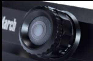
56mm objective lens, High Master lens system