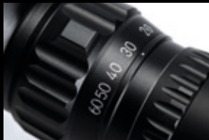
67-82mm eye relief wide angle