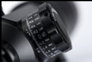
6x-60x zoom range, 10x zoom ratio

0 - 150 MOA Windage - 50 MOA turret turn