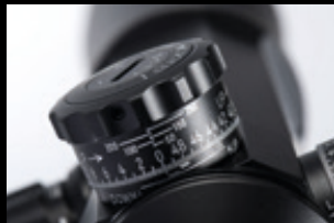
6 level illuminated power settings

0 - 400 MOA Elevation - 50 MOA turret turn