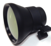
2X AFocal sold separately